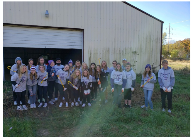
Day in Action cleaning up SOH new property